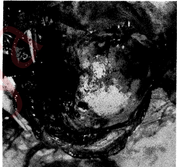
Figure 3. The per-operative photograph of the patient prior the transcranial resection of the cranial involvement.